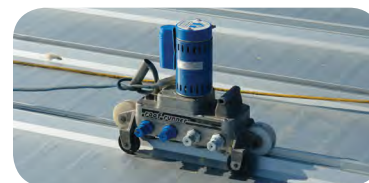
Butler's exclusive Roof Runner® completes the industry's only field-formed 360-degree Pittsburgh double-lock seam.

weathertight for up to 25 years—and it routinely outlives its warranty. You'll save every year on roof maintenance costs, resulting in significant lifecycle savings. In fact, the MR-24 roof system has been documented to save up to 90% in roof maintenance costs vs. traditional roofing materials*.